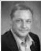
Jim Haigh Imagewear